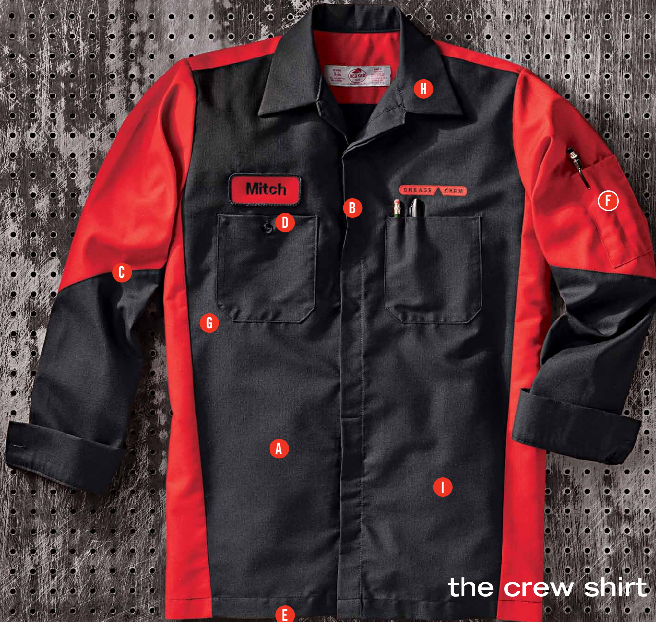
the crew shirt

Our Crew Shirt may be new to you, but it's no stranger to hard work. Field tested for durability and comfort, it's been proven to have everything it takes to get the job DONE RIGHT .