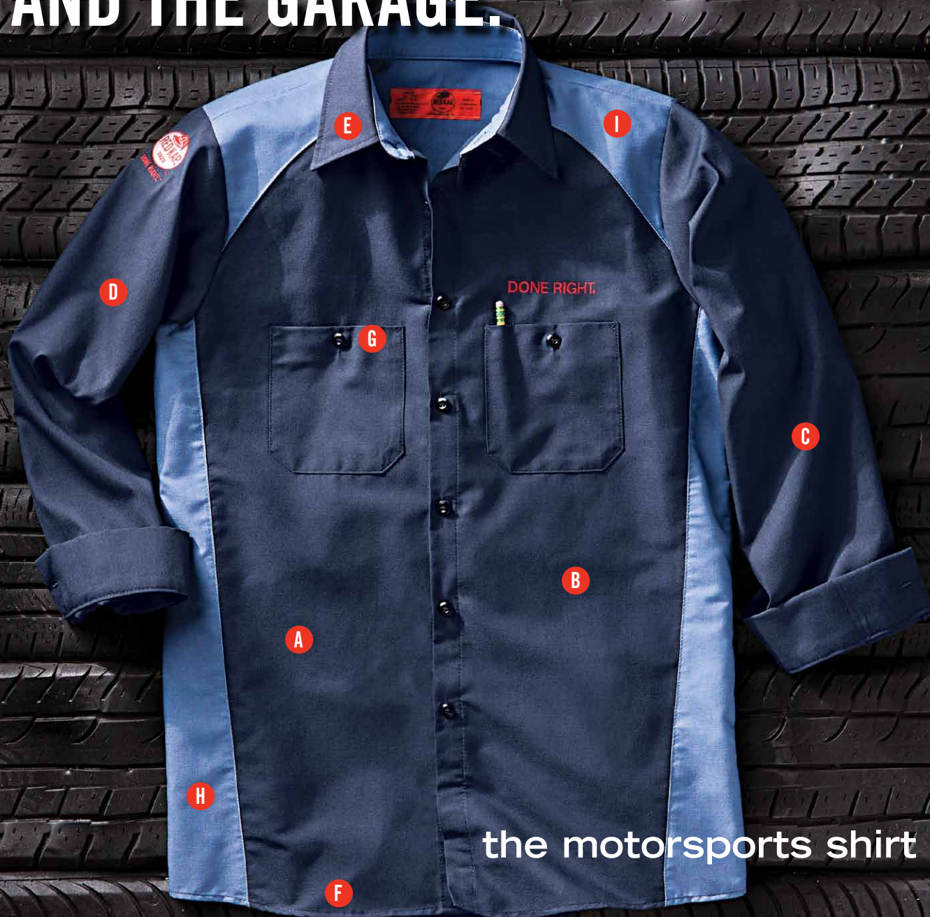
the motorsports shirt

Grease, oil and dirt don't stand a chance against our Touchtex™ Technology, and the color block styling is classic automotive.