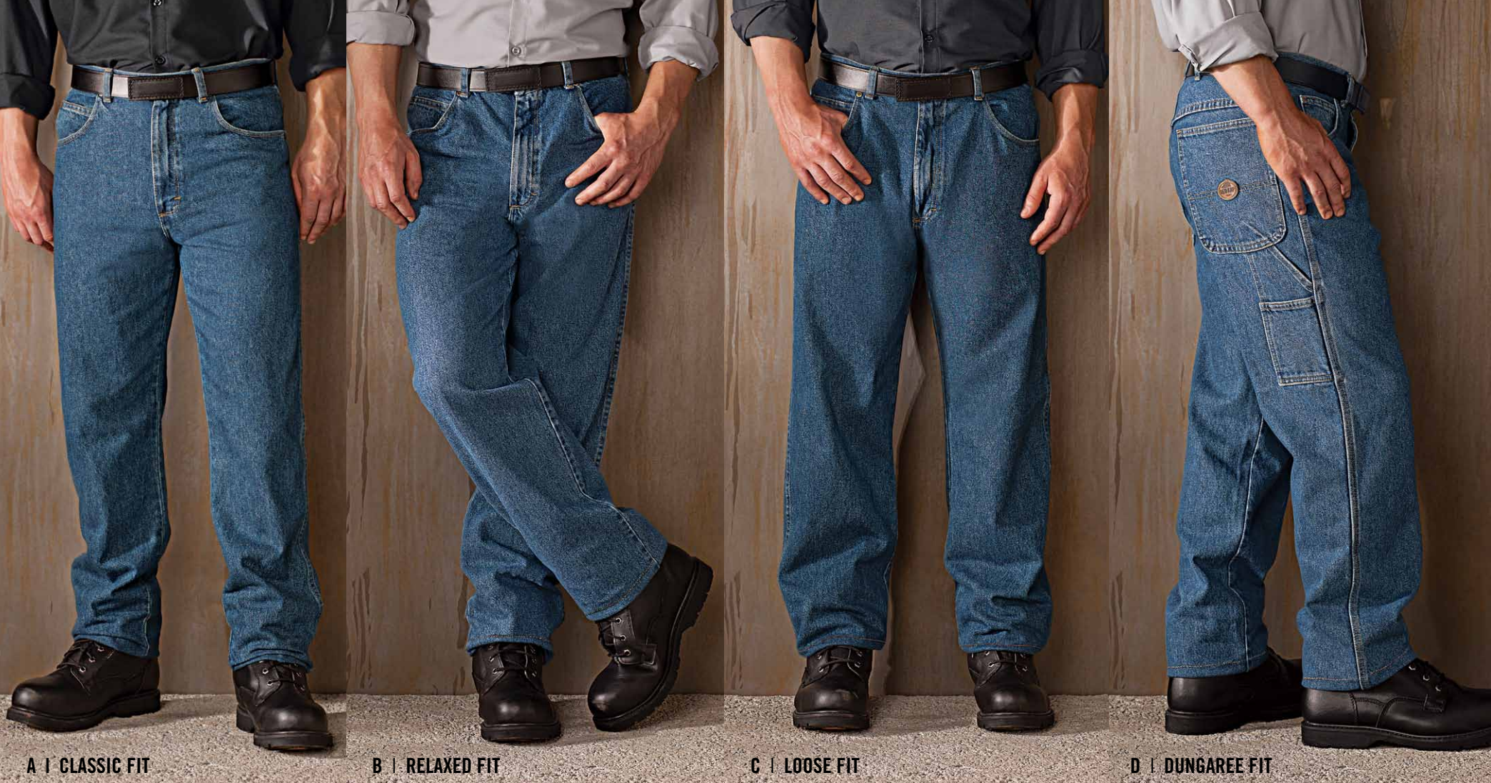
A | CLASSIC FIT